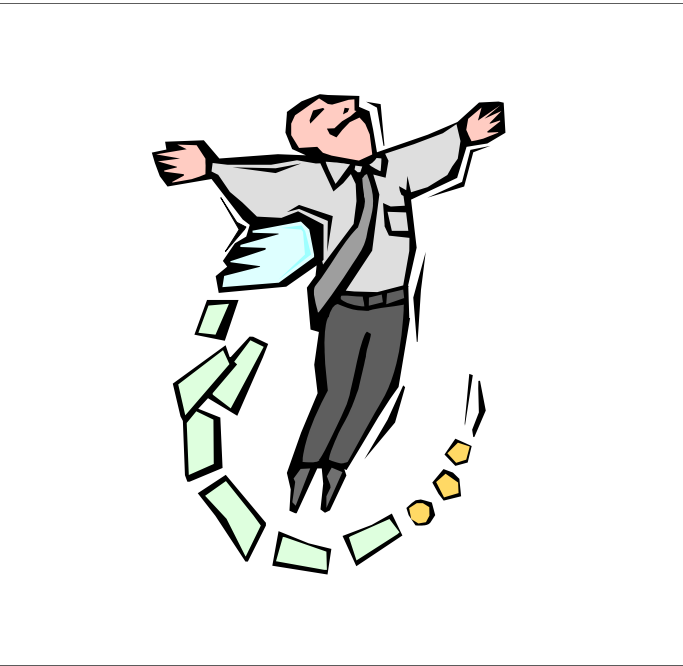
Investment bubbles boost a market past the point of common sense, usually on the basis of a “story” that later proves to be nonsense.

Also, the Internet had not been dominant enough in the 1990s to enhance productiv-