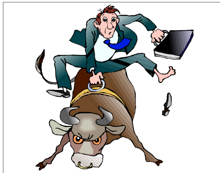
Mutual fund managers often fail when trying to ride the market to higher returns.

Among individual fund categories, large cap value funds had the best record, with only 53 percent losing out to the S&P 500 Value