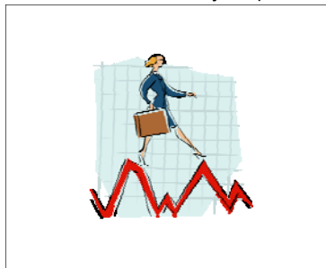
Every time the U.S. stock market has had a bad 10-year period it has delivered much better returns over the next 10 years.

While future returns are never guaranteed, investors who suffered through the last 10 years have cause for optimism about the future.